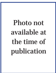
Photo not available at the time of publication